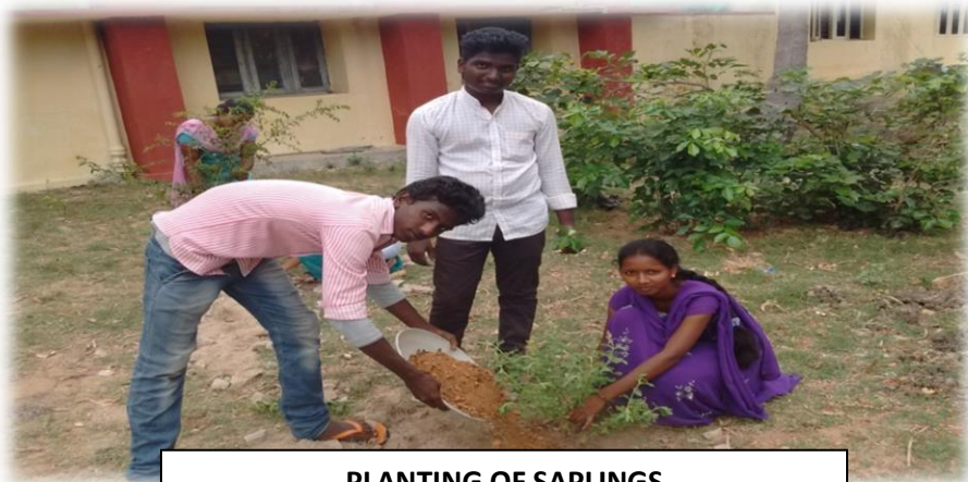
PLANTING OF SAPLINGS