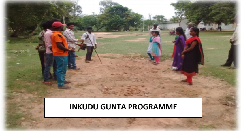
INKUDU GUNTA PROGRAMME