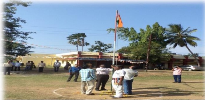
FLAG HOSTING BY INDEPENDENCE DAY BY PRINCIPAL