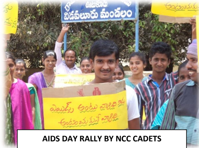
AIDS DAY RALLY BY NCC CADETS